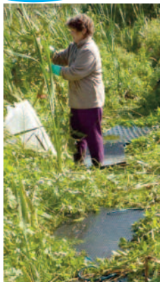
Sections of horse mats used to float on marsh

These strategies helped St Dogmaels Community Association clear 50 acres of Himalayan balsam, including difficult areas of marsh, cliffs, blackthorn and dumps.