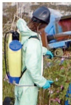
Spraying where access is dangerous e.g. dumps. Have appropriate training and protective equipment.

For more information contact your local Keep Wales Tidy officer www.keepwalestidy.org . For information on species identification, alerts and biodiversity visit www.nonnativespecies.org .