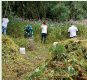
Volunteers pulling Himalayan balsam