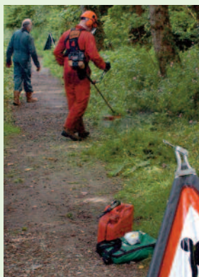
In public spaces, have lookouts, protect the public