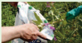
Careful no seeds escape