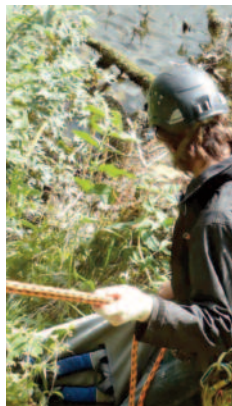
Tree surgeons abseiled cliffs (on their own insurance)