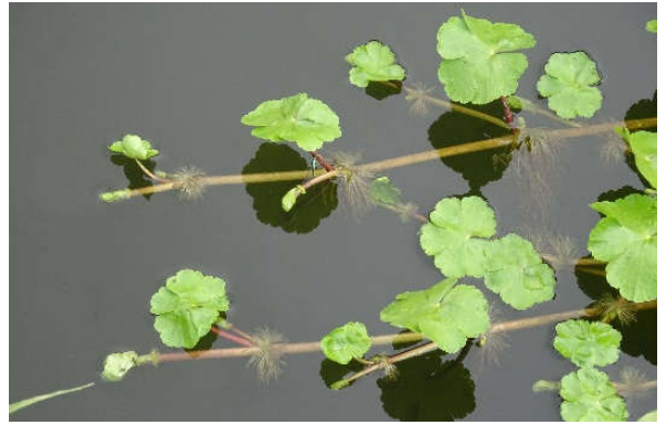
Floating Pennywort, August

The invasive weed Floating Pennywort ( Hydrocotyle ranunculoides ) is becoming a major problem on the Cam and Ouse. It grows rapidly (up to 20cm/day in summer) from tiny fragments of stem which drift down the river then grow into large rafts that float on the water and block the river.