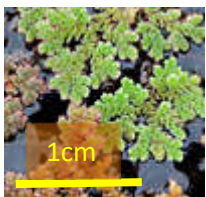
Azolla / Water Fern