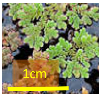
Azolla / Water Fern