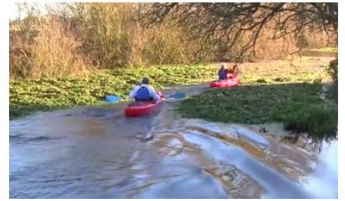
Floating Pennywort on upper Cam: Dec 2016

If you would like to join a pennywort pulling working party on the upper Cam, please contact info@camvalleyforum.uk